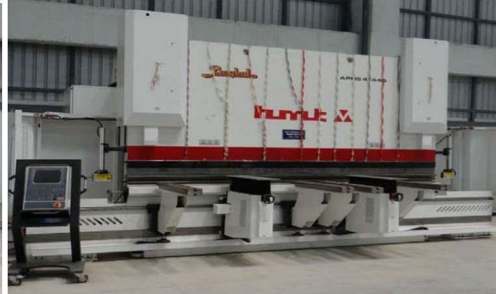
FACILITY : CNC HYDRAULIC PRESS BRAKE