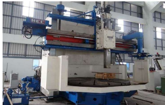
FACILITY : CNC VERTICAL TURNING LATHE