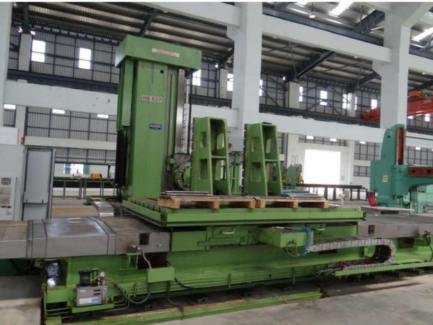
FACILITY : CNC HORIZONTAL BORING & MILLING MACHINE