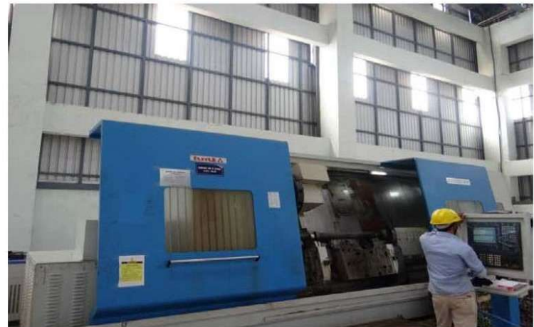
FACILITY : SLANT BED CNC LATHE