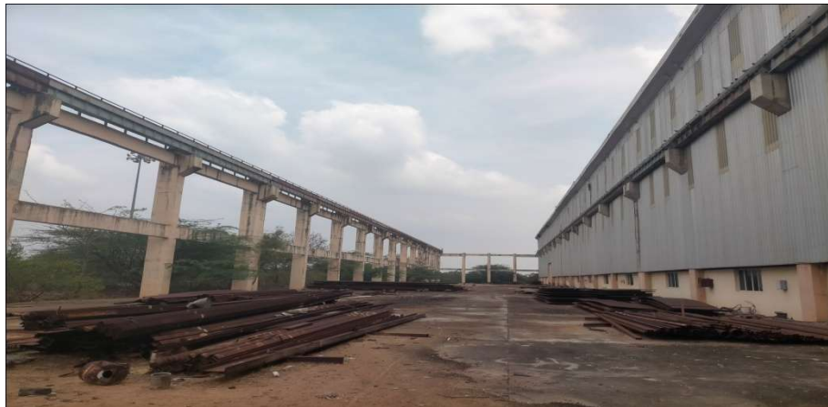
Open shed with EOT Cranes