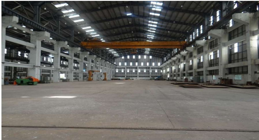
Shop/ Warehouse (2 bays) with EOT Cranes, Machines on back side