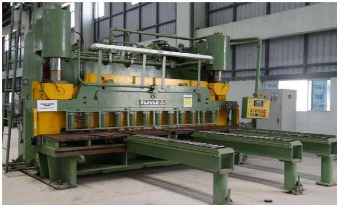
FACILITY : HYDRAULIC SHEARING MACHINE